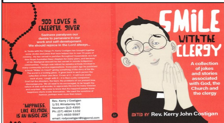
Any profits from the sale of the book will be used to offer some financial support to our sick and elderly priests.