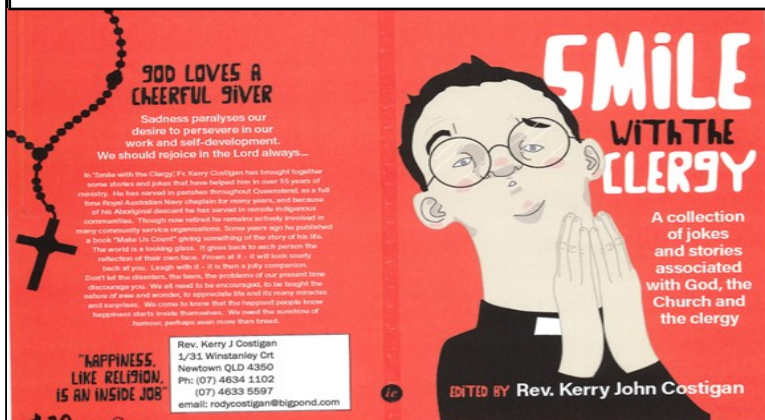
Any profits from the sale of the book will be used to offer some financial support to our sick and elderly priests.