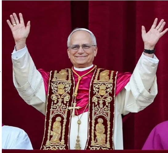
CARDINAL Robert Prevost, the Chicago-born prefect of the Dicastery for Bishops under Pope Francis, was elected the 267th pope and took the name Pope Leo XIV on May 8.

Echoing the Psalmist, we pray: "May the Lord preserve him and give him life and make him blessed upon the earth".